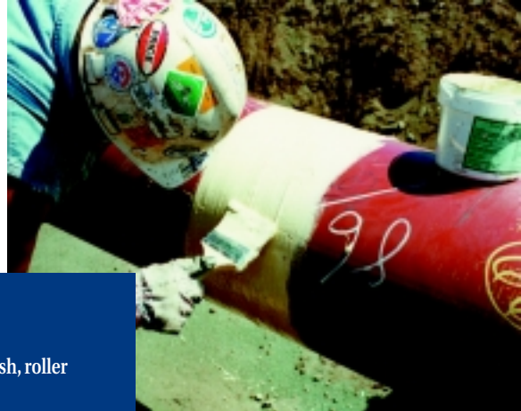
Protal hand application.