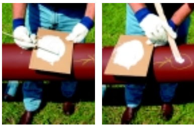
Protal cartridge pack application.