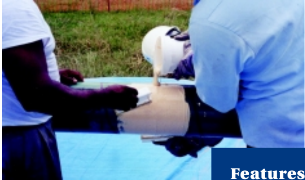
Protal applicator pad application.