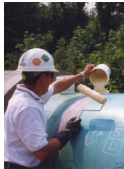
Protal being poured onto pipe.